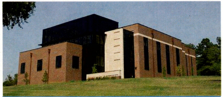
CHEROKEE COUNTY CAMPUS