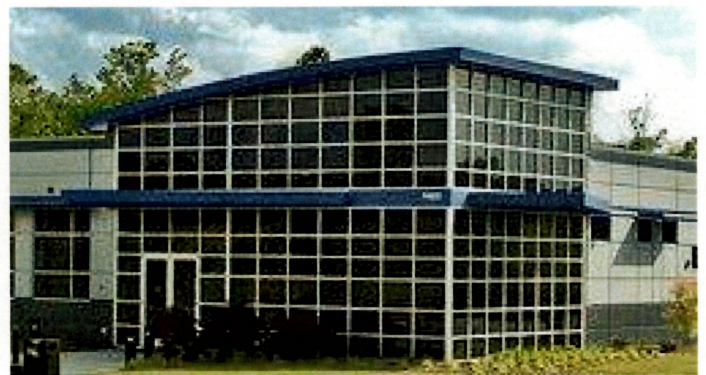
UNION COUNTY ADVANCED TECHNOLOGY CENTER