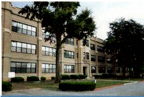
SCC DOWNTOWN CAMPUS