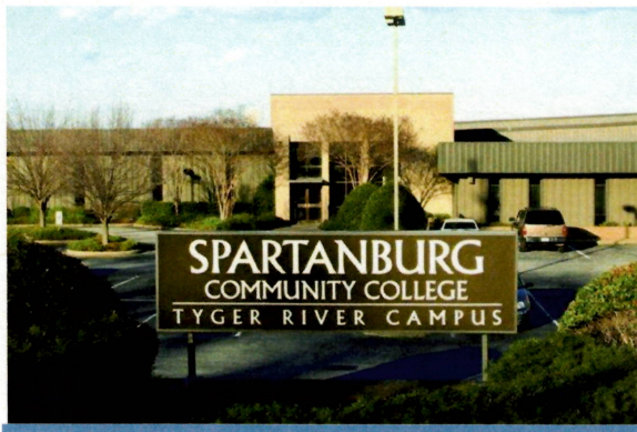
TYGER RIVER CAMPUS