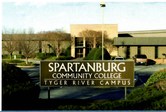
TYGER RIVER CAMPUS