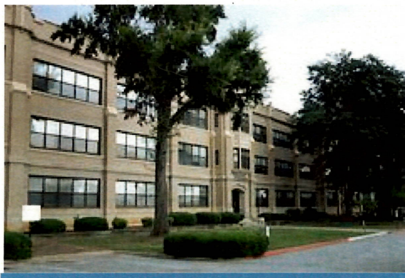
SCC DOWNTOWN CAMPUS