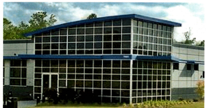
UNION COUNTY ADVANCED TECHNOLOGY CENTER