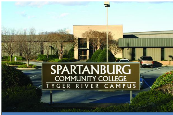
TYGER RIVER CAMPUS