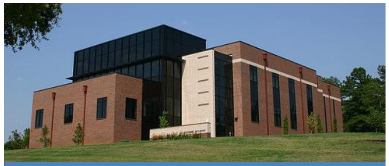
CHEROKEE COUNTY CAMPUS