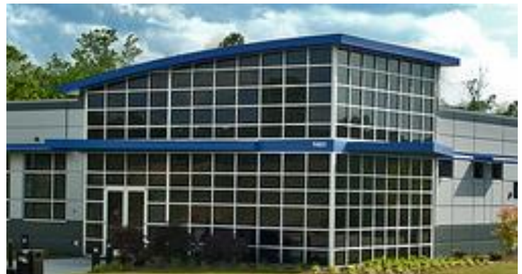
UNION COUNTY ADVANCED TECHNOLOGY CENTER