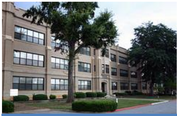
SCC DOWNTOWN CAMPUS